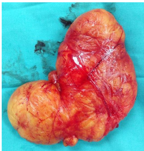
Fig1- specimen of a lipoma

Management is conservative unless they are large or unsightly, in which case a local excision is curative.