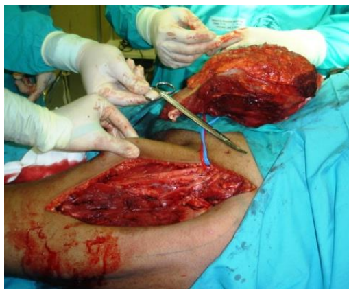
Fig5- surgical image showing the specimen and the surgical field defect following a wide local excision

With palliative surgery (an incurable lesion, with metastases or extensive local disease) the aim is to provide a comfortable residual life. Local resections (which may leave residual disease) are marginal (local excision of the mass), or intracapsular (de-bulking of the tumour).