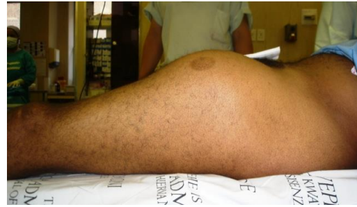
Fig 3- large mass in the proximal anterior thigh of a patient

The differential diagnosis is limited, and all soft tissue masses must be regarded as sarcomas until otherwise disproven by investigation. It is common for patients to notice a lump after minor trauma, and to misinterpret it as a “haematoma” or a “bruise”