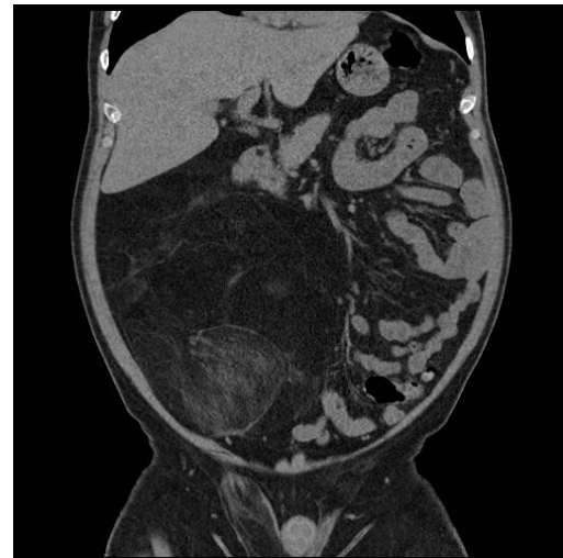
Fig4- CT scan showing a massive liposarcoma occupying the right side of the abdomen

Staging is performed by a CT scan of the area in question, together with that of the liver and lungs (a CT of the lungs may reveal metastases not shown on a radiograph). A liver enzyme profile is performed to determine hepatic metastases. A MRI scan provides excellent imaging of soft tissue sarcomas. Rarely an arteriogram may be performed to determine the source of the feeding vessels.